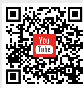
Scan QR Code to Watch Video

For after-sales service and support: Email: sales.support@audioplus-india.com Telephone: 022-42869010 / 49 / 57