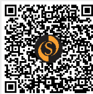
Scan QR Code for More Details

For sales, support, pricing and availability: Email: info@audioplus-india.com Telephone: 022-42869000 / 001 WhatsApp: +91-8879028079 (Monday to Saturday between 10:00 a.m to 6:00 p.m.) Contact Us: http://www.studiomasterprofessional.com/home/contact