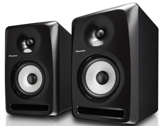
Pioneer S-DJ X

inputs to choose from including balanced XLR and TRS phone, and unbalanced RCA. The high frequency level control allows DJ's to adjust treble levels to suit their needs and environment. The speakers feature environmentally friendly "Auto Standby" mode, which reduces power consumption by switching power to stand-by if there is no input over a set period of time.